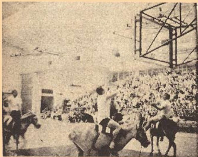
STUDENT TRIES to break tie.

Donkey Basketball; what's that? Well, this question was answered for many Eagles at the Donkey Basketball game, that was held March 9th in the Eisenhower Gymnasium.