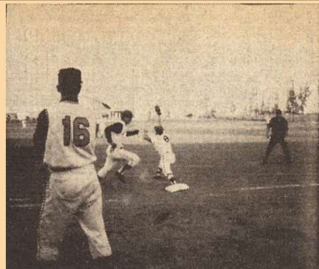
EAGLE REACHES to scuddle Pirate.